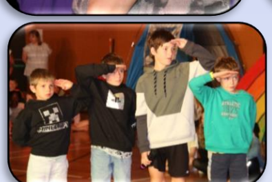
Production Rehearsal Day