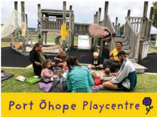
Port Ōhōpe Playcentre

Port Ohope Playcentre, 340 Harbour Road OPENING HOURS: 8AM – 5:30PM