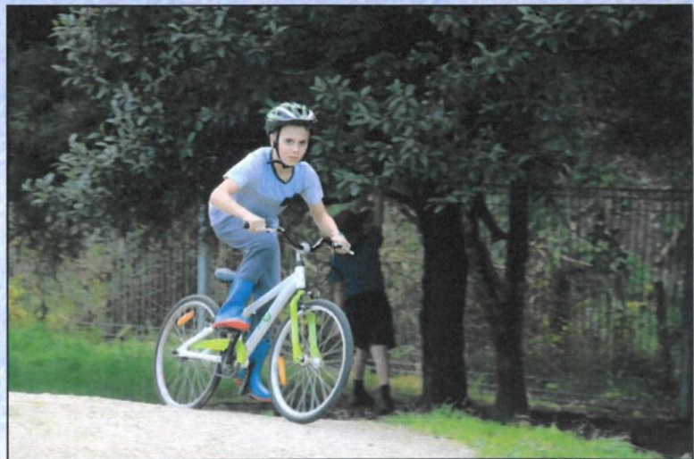
Bike fun during break times.