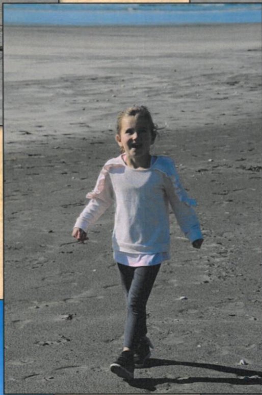
PRIDE Time at the beach