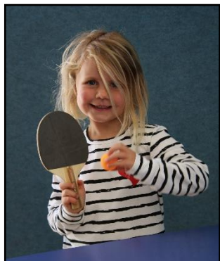
Table tennis was very popular with the children as they persevered to master the skills. Well done to these children who are modelling the Pride Values of Positivity, Respect, Integrity, Diligence and Empathy at school.

Congratulations to the children who attended Pride Time last Friday.