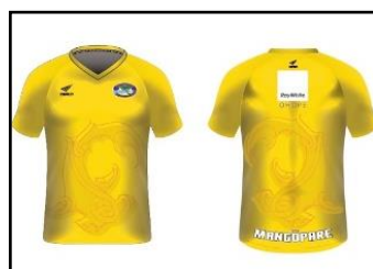
Ray White Real Estate Mangōpare