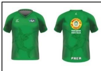
Four Square Ray White