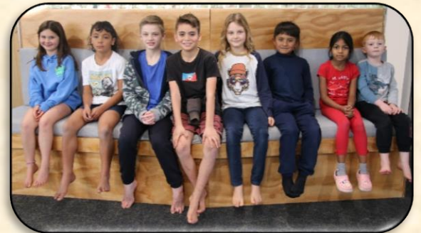
Pride Certificates Week 9

Congratulations to the students who have received a Pride Certificate for demonstrating our Pride values at school. Great work everyone. Keep up the excellent work as the term progresses.