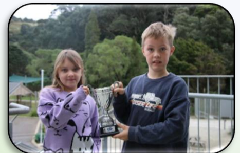
Week 10: Kahikatea

Each week a trophy is awarded to a learning space for looking after their environment both inside and outside. Thank you to all the children for modelling kaitiakitanga in our kura.