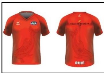
Holland Beckett Aihe