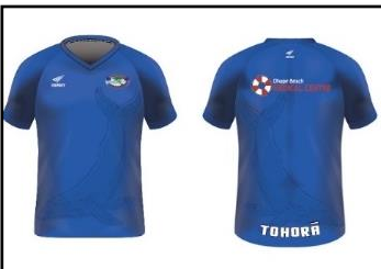
Ōhope Medical Centre Tohorā

Thank you to our House Groups Sponsors who enable us to have house shirts for the students.