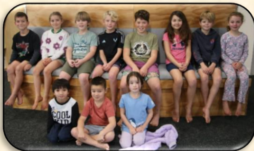
Pride Certificates Week 10