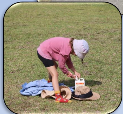
Safety Day and Surf Competition Day