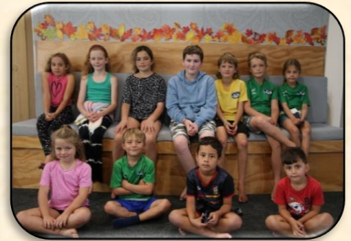
Pride Certificates Week 7