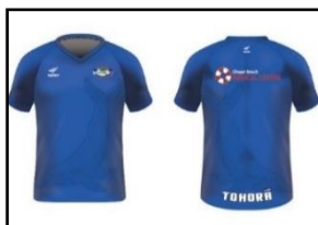
Ōhope Medical Centre Tohorā