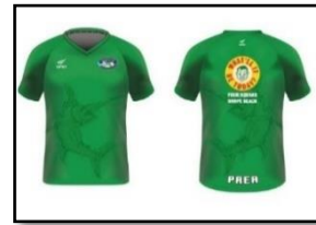
Four Square Paea