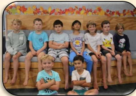
Pride Certificates Week 6

Congratulations to the students who have received a Pride Certificate for demonstrating our Pride values at school. Great work everyone. Keep up the excellent work for the rest of the year. Tumeke.