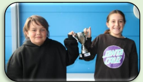
Week 7 Ngā Huiarau

P ositivity R espect I ntegrity D iligence E mpathy