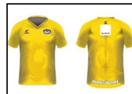
Ray White Real Estate Mangōpare

Thank you to our House Groups Sponsors who enable us to have house shirts for the students.