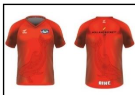
Holland Beckett Aihe