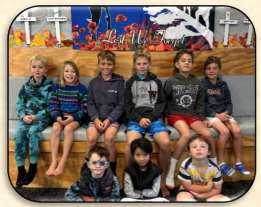
Pride Certificates Term 2 Week 1